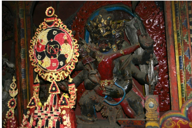
Fig. 4 A large torma (dough-and-butter sculpture) representing Tsochok Khagying and his consort, standing on an altar in front of a clay image of the same pair of divinities, Lubrak Village, Mustang District, Nepal

abstract geometric form as a mandala, where he and his consort are denoted at the center by the interlaced letters A and MA. 7 In another form of the mandala (fig. 5), Tsochok and his inner circle take the shape of ritual daggers and ritual claws, while the Zema, the Female Champions, and the Jinte are embodied respectively by hooks, arrows, and wooden plaques or tablets.