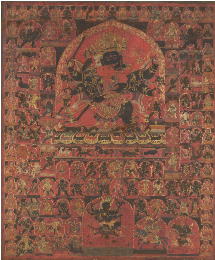
Fig. 1 Bon Deity Trowo Tsochok Khagying; Tibet; 15th century; distemper, ink, gold on cloth; 31 × 26 in. (78.7 × 66 cm); The Metropolitan Museum of Art, New York; Gift of Carlton Rochell, in honor of John Guy, and in celebration of the Museum's 150th Anniversary, 2018; 2018.890; CC0 – Creative Common (CC0 1.0)