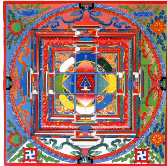
Fig. 5 Mandala of Trowo Tsochok Khagying; image after Tenzin Namdak, Yasuhiko Nagano, and Musashi Tachikawa, eds. 2000. Mandalas of the Bon Religion . Osaka: National Museum of Ethnology, 73

All the members of the entourage who fall outside the Fierce Ladies—the Champions, the Warlords, and the Steadfast Ones, as well as others who are not featured in this thangka—do not appear in the inner mandala at all but have their own separate residence, known as the “outer support arrangement” ( chitenko ) 8 (figs. 6 and 7). This is an assemblage comprising a long vertical spear surrounded by sets of objects: eight smaller spears, with the horns, fangs, and claws of different animals as spearheads; arrows fletched with feathers of different colors; sacks of various substances (grains, minerals, and so forth), posts, cairns, and banners that are all connected to the central spear with cords festooned with the forelegs of animals and stuffed groups of birds, among other things. All these components are the supports of the divinities in the outer