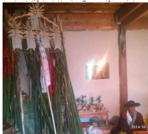
Fig. 8 A jadang constructed as part of a ritual for the propitiation of protective divinities in a house in Thewo, Sichuan, China; photograph by Ngawang Gyatso, 2014