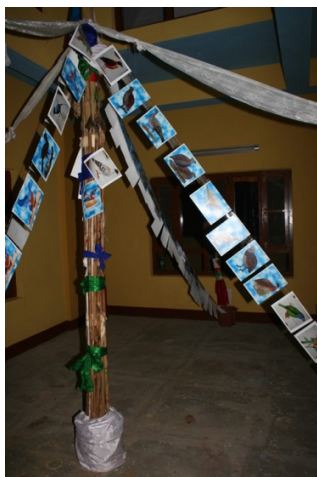
Fig. 7 Part of a chitenko , Tritten Norbutse Monastery, Kathmandu, Nepal; photograph by Anna Sehnalova, 2012