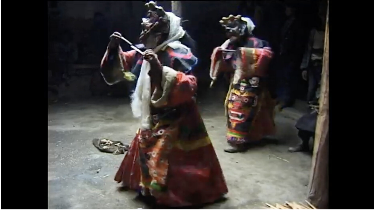
Fig. 3 Bon Rituals, "Between the Lines: Exorcising the Old Year in a Himalaya Bonpo Village," YouTube , June 19, 2022, 1:20:17, https://youtube.com/watch?v=SqiN_0wRXls