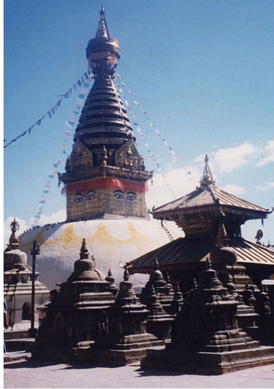
Fig. 6 Swayambhu chaitya, Kathmandu, Nepal, as seen from the northeast, with the tiered temple dedicated to the goddess Hariti in the foreground on the right, September 2003; photograph by Alexander von Rospatt