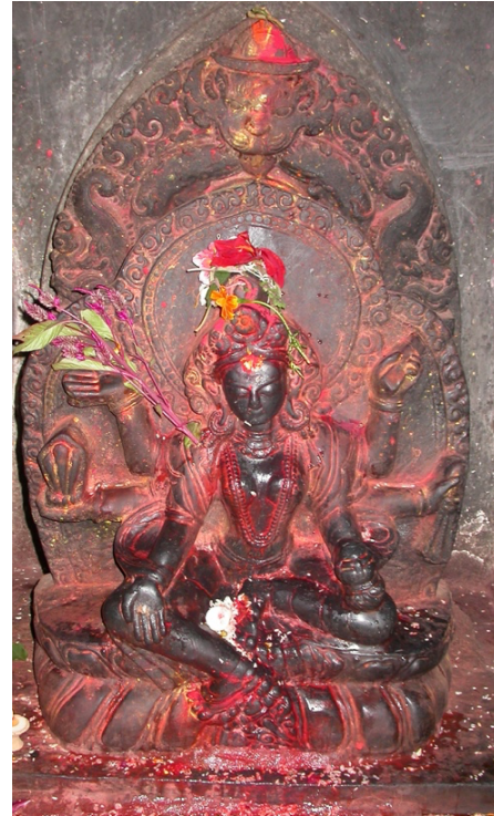
Fig. 9 Vasudhara, in the shrine known as Vasupura adjacent to the Svayambhu chaitya, Kathmandu, Nepal; height from its lotus base to the apex approx. 29 ½ in. (75 cm); This image of the Buddhist goddess of fertility and plenitude is seen here as it appears after it has been worshipped by the faithful as part of their circumambulation of the chaitya.