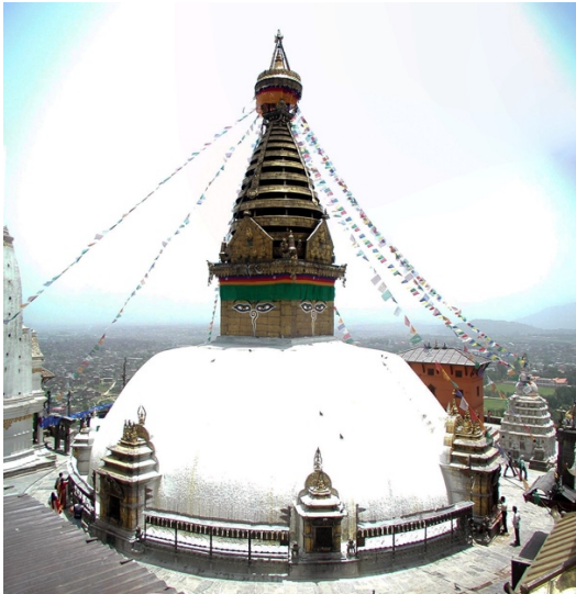
Fig. 4 The northwestern face of the Swayambhu chaitya, Kathmandu, Nepal, with the niches of the Buddha Amoghasiddhi in the north, Amitabha in the west, and the goddess Aryatara in between, 2002; photograph by Manika Bajracharya, Lotus Research Centre, Lalitpur

(chattrā). The portion of the yashti rising above the harmika measures nearly 40 feet (12 meters), giving the chaitya a total height of more than 82 feet (25 meters). Each side of the harmika is adorned by a pair of eyes (fig. 5); the nose-like curl, a derivative of the tuft of hair between the eyes of the Buddha (urna) and the light it emits, was not added until the early twentieth century. 3