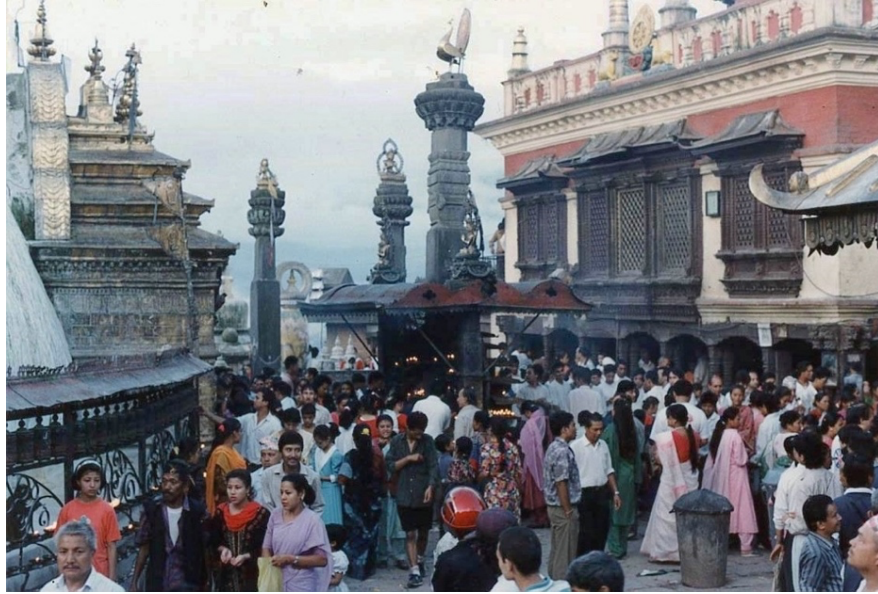
Fig. 2. Buddhist devotees in the early hours for their daily worship of Svayambhu, Kathmandu, Nepal, during the “month of virtue” ( gumla), dedicated to the pursuit of meritorious action, August 1996; the Drukpa Kagyu monastery is seen at right, facing the western side of the chaitya

The Kathmandu Valley is located on the southern flank of the Himalayas, sandwiched between the Gangetic plane of India and Tibet, along major trade routes—a situation that made it an important conduit for the transmission of Indian Buddhism to Tibet. Across the centuries Tibetan pilgrims and translators of Buddhist scriptures have stayed at Svayambhu. The chaitya repeatedly attracted major donations from Tibetan Buddhists, including sponsorship of renovations, the most recent example being the regilding of the chaitya’s spire (fig. 3) and niches undertaken by the Nyingma Institute of Berkeley, California, from 2008 to 2010. 1 Since at least the early nineteenth century the Tibetan tradition has also been present in the form of Drukpa Kagyu and Karma Kagyu monasteries in the immediate vicinity of the chaitya.