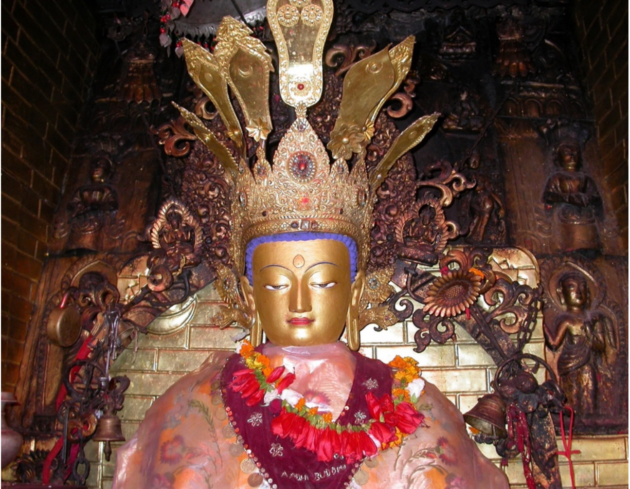
Fig. 10. The image of Buddha Amitabha set in the western niche of the Svayambhu chaitya, Kathmandu, Nepal, in September 2003; photograph by Alexander von Rospatt. In addition to circumambulation—the standard manner of venerating chaitya and stupas—Svayambhu is worshipped principally through this image.

The presence of these five buddhas turns the chaitya into a “buddha abode” (buddha-alaya); collectively, they embody the qualities of Buddhahood and render it present, just as the self-manifesting, luminous dharmadhatu of the Svayambhupurana does. In this, the Svayambhu chaitya represents not an exception but the rule. For, in tantric Buddhism (vajrayana), chaityas (and stupas) are imbued with the presence of Buddhahood mainly through the employment of elaborate rituals and not (or less so) through the enshrining of relics.