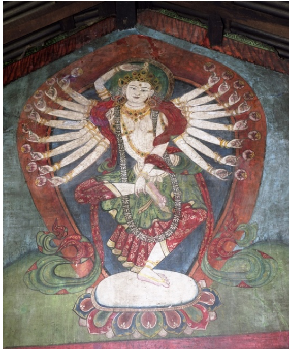
Fig. 8 Lord of Dance, detail of a mural painting in Shantipur, a tantric temple adjacent to the Svayambhu chaitya; Kathmandu, Nepal; photograph by Stanislaw Klimek, fall 2002. Shantipur is dedicated to a form of Chakrasamvara and often identified with ether as the fifth element. As the elaborate secret rituals carried out in the temple may entail the performance of tantric songs and dance, the Lord of Dance, a form of Lokeshvara known as Padmanrityeshvara, presides over the mural paintings adorning the inside walls (see Rospatt 2014).

Also, the chaitya is supplemented by a tantric temple (fig. 8) and surrounded by four shrines (fig. 9) dedicated to the elements, namely, earth, wind, fire, and water, which are propitiated to gain protection and prosperity.