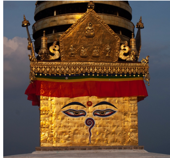
Fig. 5 The western side of the harmika of the Swayambhu chaitya, Kathmandu, Nepal, adorned by a pair of eyes and other facial features, as is each side of the harmika; here, the gilded copper is lit up by the setting sun, June 2010

These eyes are often identified with the Buddha and his compassionate and all-knowing gaze, and the copper shields mounted above the harmika's sides, which give the impression of headgear crowning the harmika , reinforce this identification. Fittingly, the Newari language designates the dome as belly ( pvata ), and the yashti can be equated with the spine, as happens in the Tibetan tradition, which refers to it as life tree (sok shing). However, such an identification of the structure with the body of the Buddha, including his eyes, is not presumed in the corresponding mythological narratives, nor is