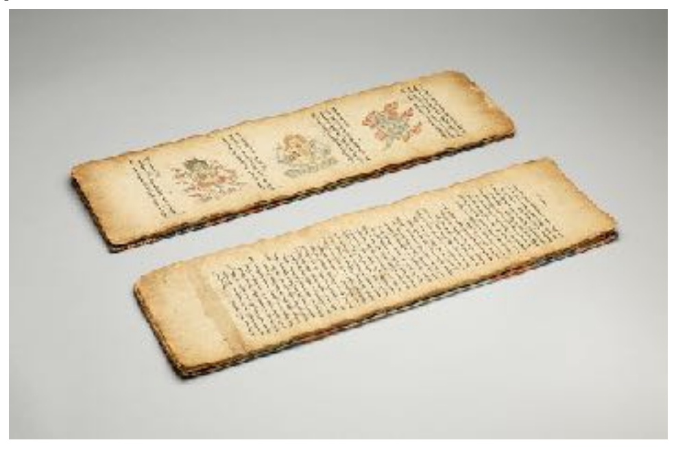
Stop 15: 515 - The Bardo Thodrol

However, this Tibetan painting lacks the subtle depth found in the Chinese model. The intense azurite blues and malachite greens are reduced to muted shades of green, and the trees' leaves and needles are rendered more schematically. On the other hand, the opulence of the highly polished Chinese court productions, with their emphasis on richly detailed decorative landscapes accented in gold, often compete for the viewers' attention, whereas in the Tibetan work the divine figures are more emphasized. The Rubin Museum's painting also includes a common Tibetan innovation to this genre, a long-life deity, the Buddha Amitayus, hovering in the sky.