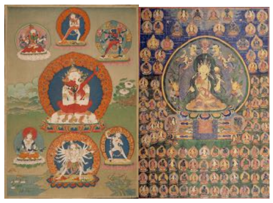
Stop 11: 511 -East Tibet

WHITE CHAKRASAMVARA After Situ Panchen's (1700–1774) Set of Twenty-Seven Tutelary Deities Kham Province, eastern Tibet; late 18th century Pigments on cloth Rubin Museum of ArtC2006.66.15 (HAR 432)