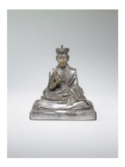
EIGHTH KARMAPA, MIKYO DORJE (1507–1554) Tibet; ca. 16th century Silver Rubin Museum of Art Purchased with funds from Ann and Matt Nimetz and Rubin Museum of Art C2019.2.1 (HAR 68498)

This silver portrait sculpture, (a new acquisition by the Rubin Museum), is important for both the figure that it represents and the style it is created in. It depicts the 8th Karmapa, Mikyo Dorje (1507-1554), identified by an inscription on the back (rje mi skyod rdo rje la na mo). This portrait sculpture displays an individuated physiognomy of this famous religious master, with high cheekbones.