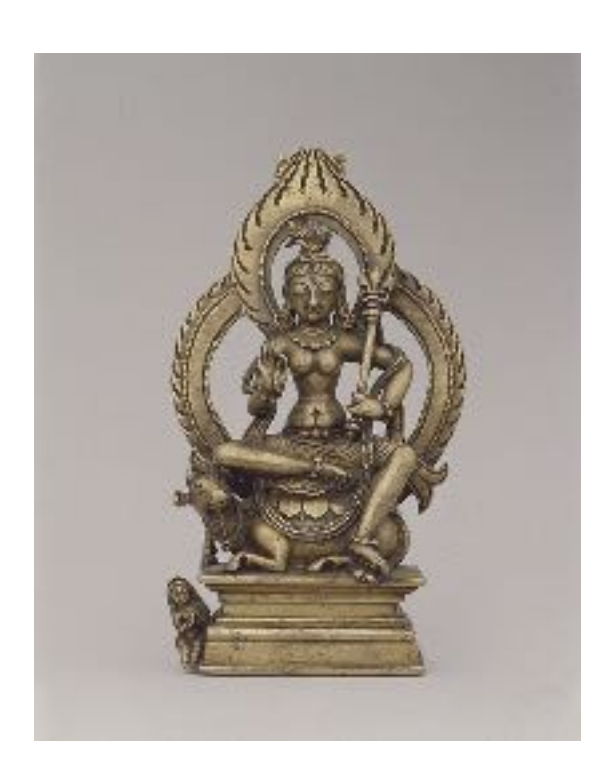
Stop 4: 604 - Kashmira

KASHMIRA Kashmir, India; 10th centuryCopper alloy with inlays of silverRubin Museum of ArtC2005.16.5 (HAR 65427)