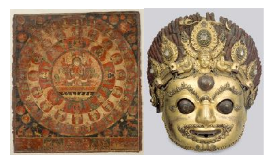
Stop 5: 505 - Nepal

MANDALA OF CHANDRA Nepal; ca. 1500 Pigments on cloth Rubin Museum of Art Gift of Shelley and Donald Rubin C2010.23 (HAR 100016)