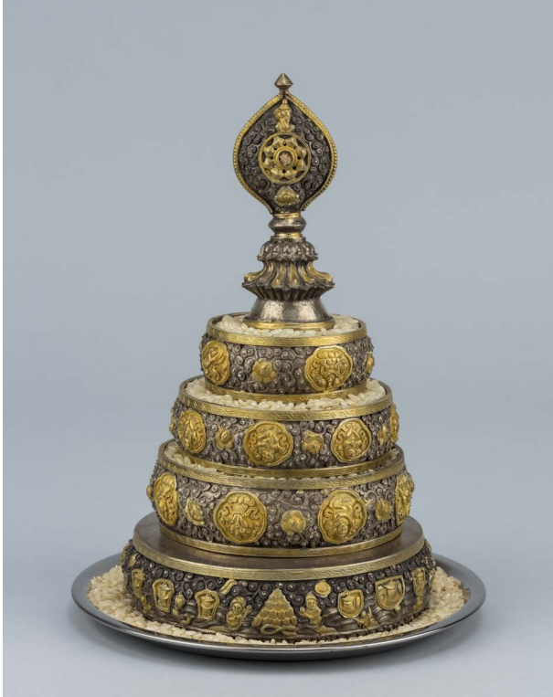
Mandala Offering Set; Tibet; mid-20th century; gilt silver; Rubin Museum of Himalayan Art; SC2012.71a-e

The mandala offering is a symbolic offering made by Buddhist practitioners. It is presented to teachers or deities. The mandala represents the entire universe. With this act of giving, the practitioner envisions offering all that is—both material and immaterial—to the universe. This act of giving is conducted for the purpose of purification and the accumulation of merit. It is beneficial in training the mind to let go of attachment.