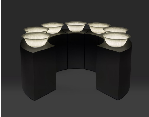
Palden Weinreb, Offerings , 2014, Wax, LED lights, wood, courtesy of the artist, Image courtesy of Palden Weinreb

mutable objects of the atmosphere. For Shrine Room Projects , Devasher presents a new two-channel video, 300 Km or the Apparent Path of the Sun (2020), filmed at one of the longest-operating solar observatories in India. The video shows the trajectory of the sun across the metal plate of the partially disabled Spectroheliograph, a device used to photograph the surface of the sun. The resulting image appears to show the sun orbiting the earth instead of the earth moving around the sun, over the course of ten minutes. In this mesmerizing video, which includes subtitles of a meditation on the sun by amateur astronomer Raj Shekar, Devasher dives into the philosophical dimension of the relativity of human perception and inspires the viewer to think about time, space, and movement in new ways.